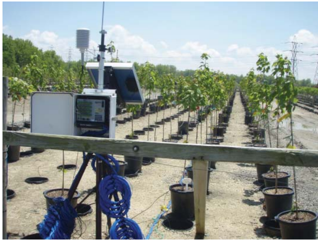
Fig. 1. Red maple trees irrigated with city or pond water for fertilizer application tests in either above- or below-ground containers.

Above- and below-ground container production systems as well as different fertilizer practices have advantages and disadvantages (21). Trees grown in the above-ground container system are easier to manage but they are subjected to more ambient air temperature fluctuations and their root growth may be concentrated on one side of the container. Trees grown in the below-ground container tree system avoid these disadvantages but they require much higher initial investment. Fertilizer application is beneficial to plants but it also creates its own problems. The application schedule for top-dressed fertilizer is flexible but care must be exercised to avoid spillage and insufficient fertility problems. Fertilizer incorporation into potting substrate places nutrients close to the root zone but to avoid toxicity the fertilizer must be thoroughly mixed during potting substrate preparation. Drip irrigation of liquid nutrients may be used during the growing season, but specialized equipment and irrigation facilities are required.